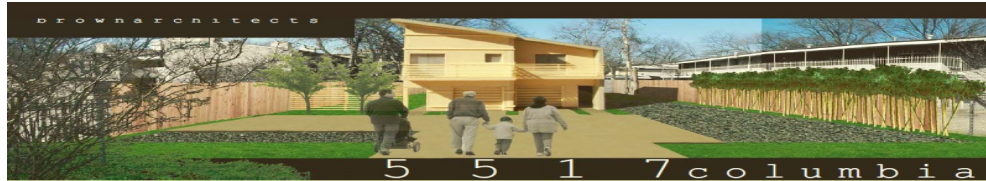
UNIT A - 921 AC sq.ft. per plans